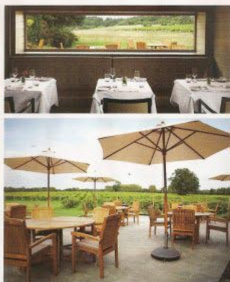
Above: nestled among Wickham's vines, Vatika's wood-panelled dining room is light and airy, with views across the Hampshire estate